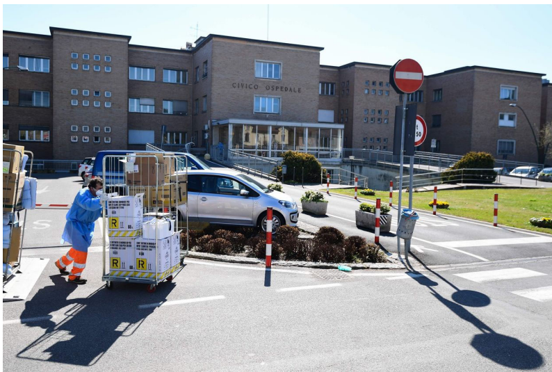
A health-care worker outside a hospital in Codogno, near Milan, in northern Italy.