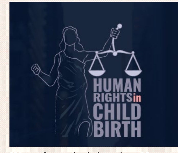
Was founded in the Hague in 2012 with the vision to protect and fulfil the full spectrum of women's rights in pregnancy and childbirth.

A lot of Social movements struggle to change childbirth practices